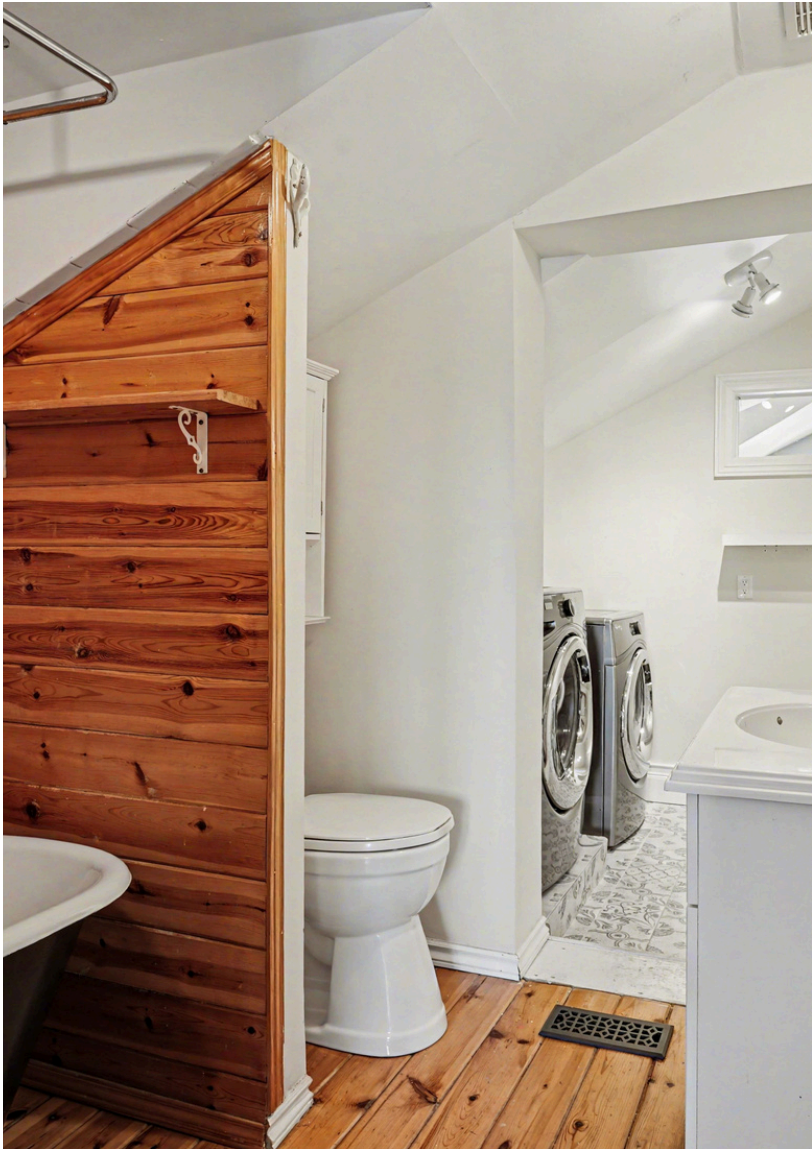
PRIMARY SUITE WITH CORNER WINDOWS, VAULTED CEILING AND FULL ENSUITE