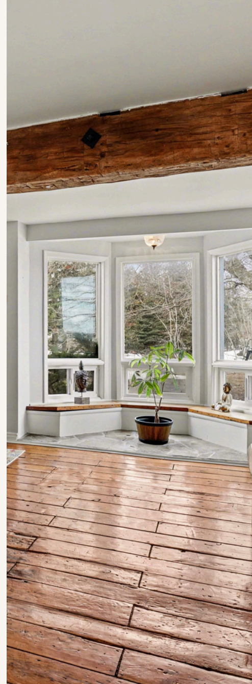
A STORYBOOK HOME, CIRCA 1895